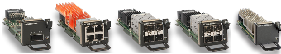
Figure 3: Five different optional port modules are offered for the Ruckus ICX 7450 with a choice of 1 GbE SFP, 10 GbE SFP/SFP+, 10GBASE-T, and 40 GbE QSFP+ options and an IPsec VPN service module.